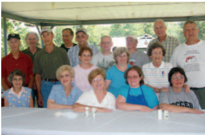
Valley's UCC group who prepare and serve wonderful food!