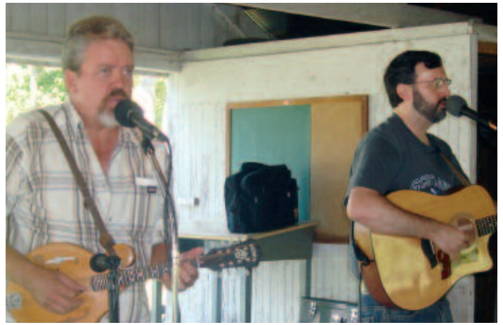
The Down to Earth Band provided entertainment