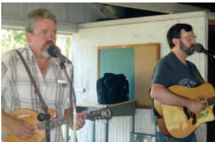
The Down to Earth Band provided entertainment