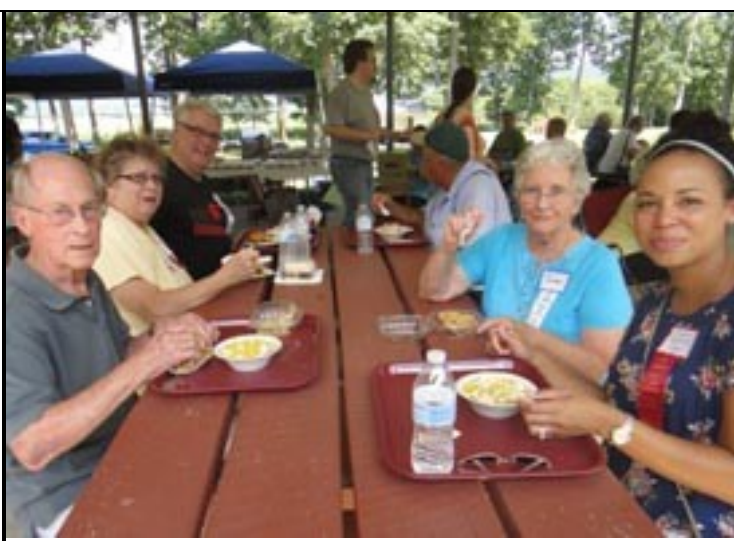
And the food!!