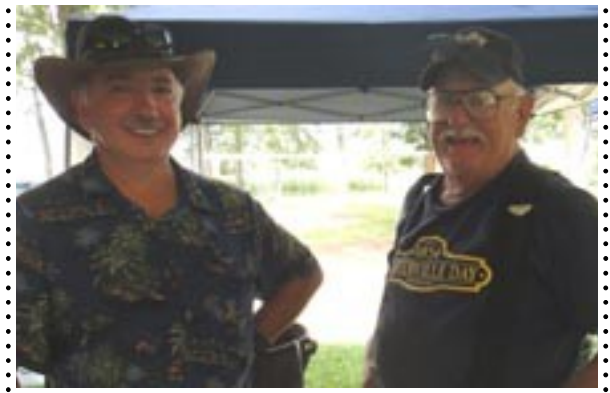
Thanks to Messiah Lutheran Church, Fisherville for providing a food stand. Delicious food! Especially