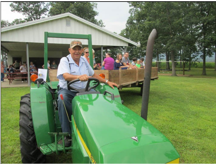
Love those hay rides!