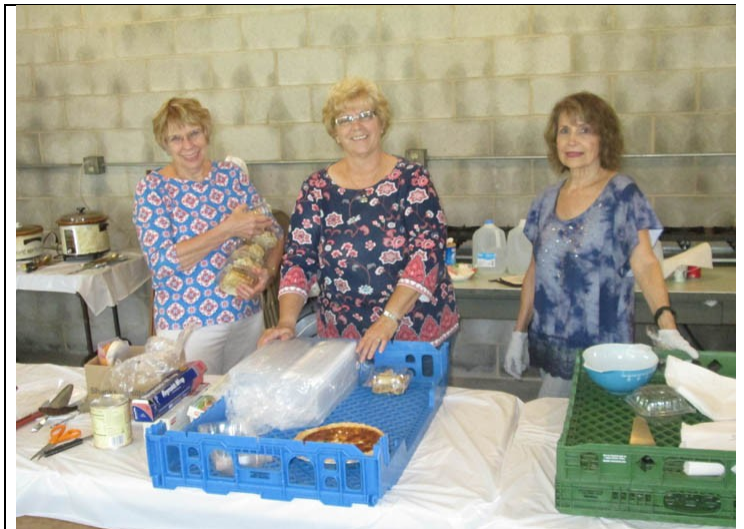
And the food!!