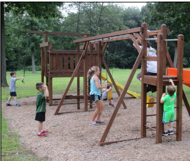
Thanks to those who spend many hours working at the Grove. Everything looks so nice. Your work is always appreciated.