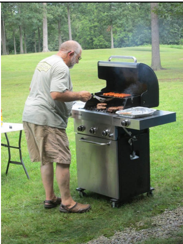
Thanks to Messiah Lutheran Church, Fisherville for providing a food stand. Delicious food, especially the desserts!