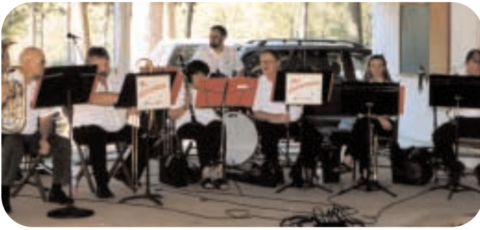
Evening entertainment by The Egerlander Band