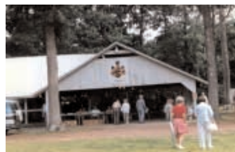
THE ENDERS GROVE as the family gathers on Reunion Day.

M any of our readers over the past few years have discovered and have used the donation envelope and card found with your semi-yearly copy of THE ENDERS CONNECTION. With your contributions, great or small, your officers are enabled to deal with the many expenses, regular and unexpected, that they must face throughout the year. Such things as taxes based on the fall assessment of $31,500.00; on going electric and other similar bills; the painting of the roofs in the Grove; all those pesky bills we all need to pay at our homes regularly. Your contributions make it possible to meet our bills regularly. Did you ever think what it might cost your Board if we didn't have volunteers and we would need to PAY cash for cleaning the Grove each Spring, do the regular painting and fixing-up and replacement required at our beautiful Enders Grove? THANKS IN ADVANCE for mailing your checks to Treasurer, Bob Enders in the enclosed envelope.