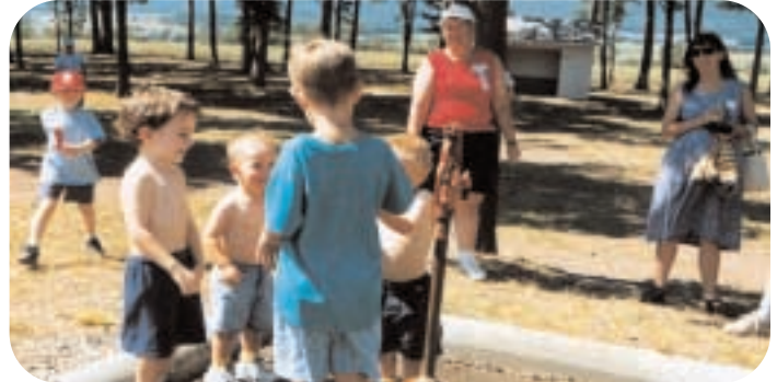
Like generations of Enders children before them, the water pump still attracts!!!