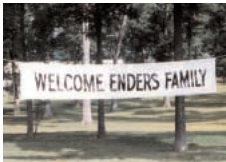
Entrance to the grove.