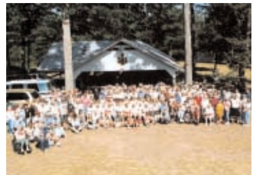
Group picture - Ender's Reunion, 2002.