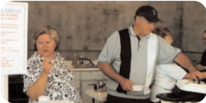
Excellent food prepared and sold by The Halifax United Church of Christ