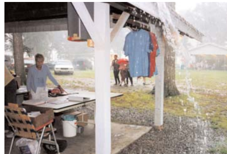
Rain at Enders Reunion, 2003.

There were some changes! Children's games were enjoyed INSIDE the Auditorium after the