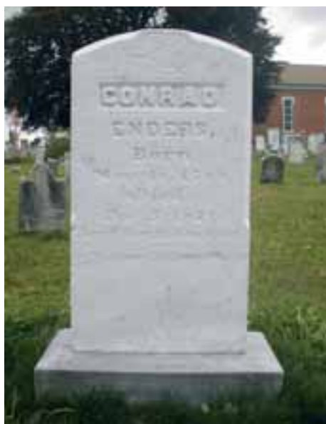
After Restoration: Stone is beautifully restored and reset onto its base, with weeds and small tree removed.