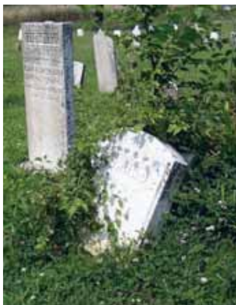
Before Restoration: Note broken headstone, weeds, grass, and small tree displacing stone.

Thanks to all who participated in this project and for the private donations that were made to fully fund this project.