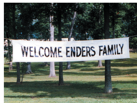
Entrance to the Grove