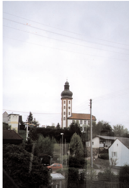
Castle Church (Third church served by same Pastor)