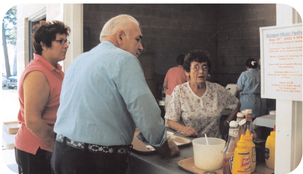
Customers at the refreshment stand