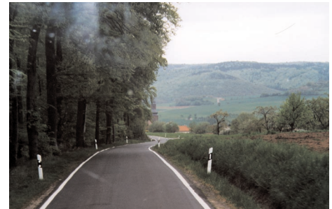
Sippersfeld is just ahead and around the curve!