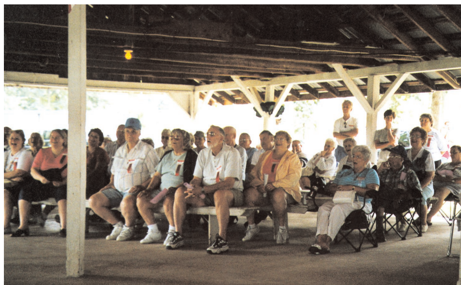
People in place during the business meeting at Enders Grove.