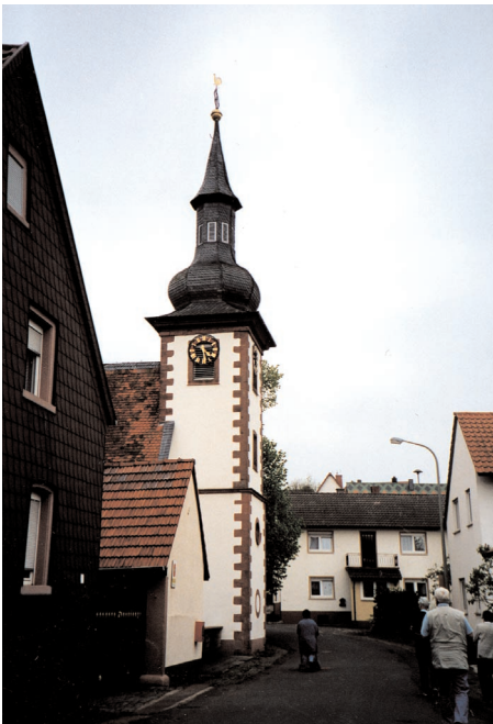
Breunigweiler Church (Captain Enders' Church)