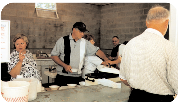
Excellent food prepared and sold by the Halifax United Church of Christ