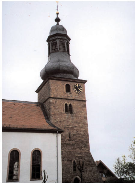
Sippersfeld Church (Anna Degan's Church)